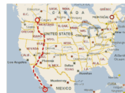
Their route through America

Once the two decided that they were going to do it; and realizing that the Great Western Trail would probably not be complete by July, they settled on a route. "We selected the area where there were the most public lands," said Joinville. "It happens to also be one of the most scenic areas in America, if not the world. The fact that we are able to make our ATVs street-legal in most states we'll go through didn't hurt either. We read the American Frontiers Journal and studied the corridor used by the Great Western Trail. Only in Utah will we not be street-legal, but Utah happens to have some of the most extensive trail systems in North America."