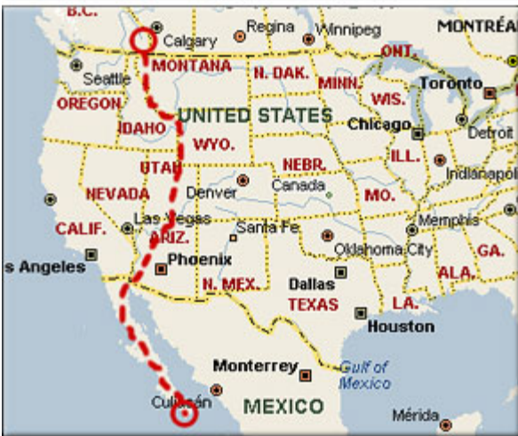
Couple Plans Ten Month